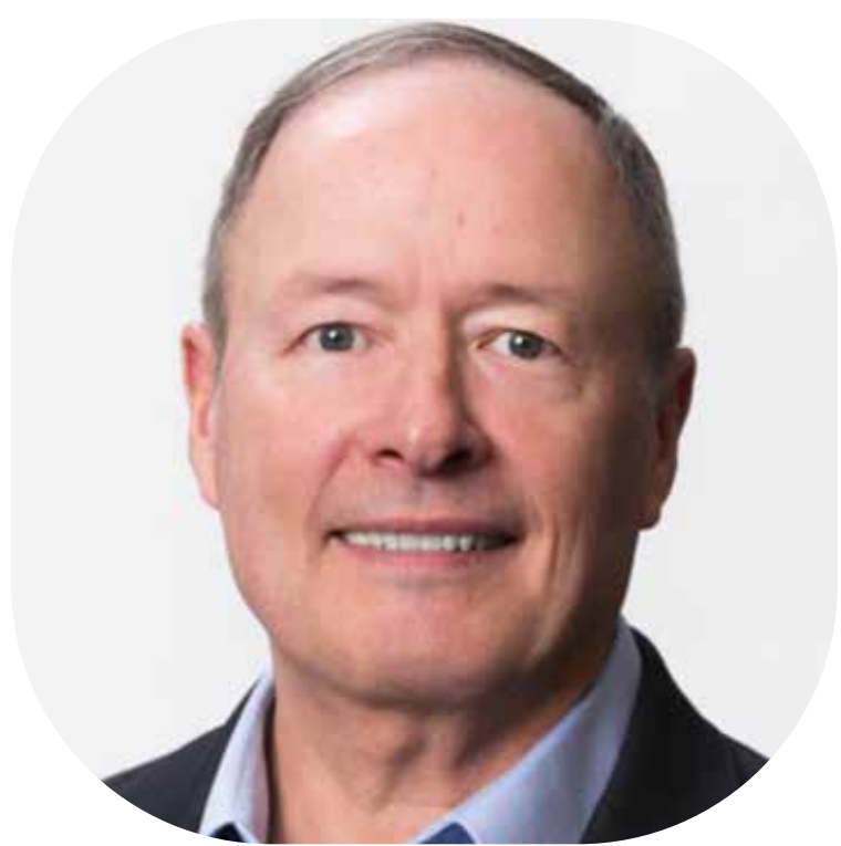
Keith B. Alexander

Former Head of National Security Agency, The first commander of the US Cyber Command